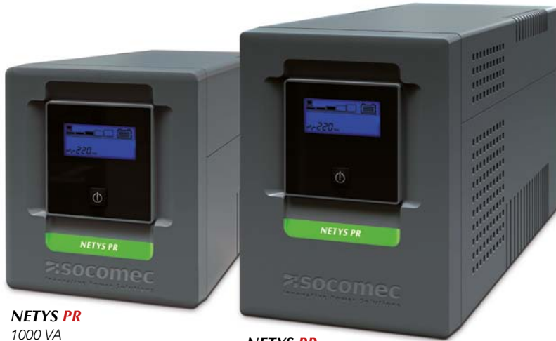
NETYS PR 1000 VA